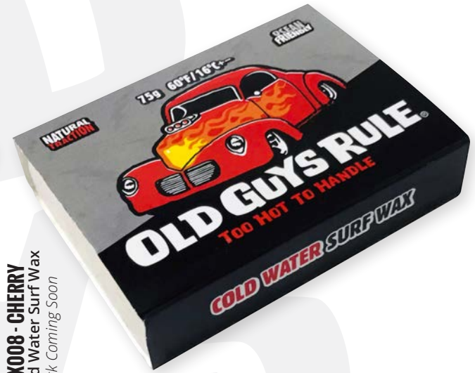
WAX008 - CHERRY Cold Water Surf Wax Stock Coming Soon