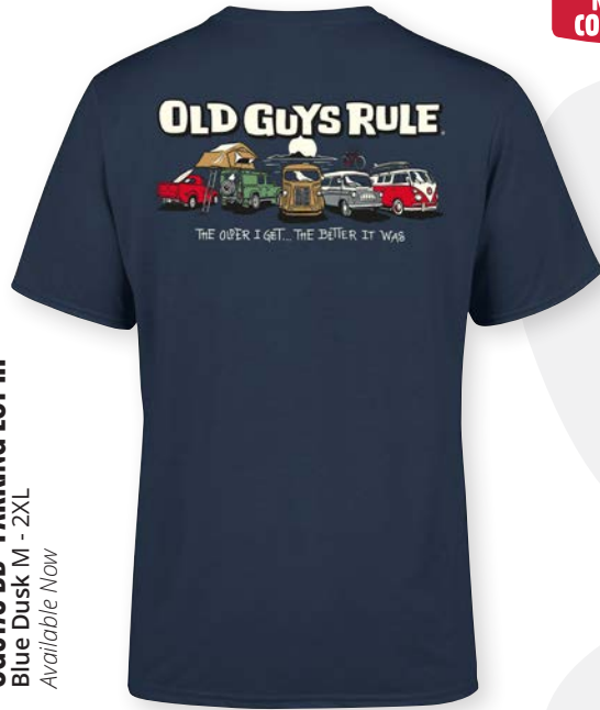
OG5178-BD - PARKING LOT III Blue Dusk M - 2XL Available Now