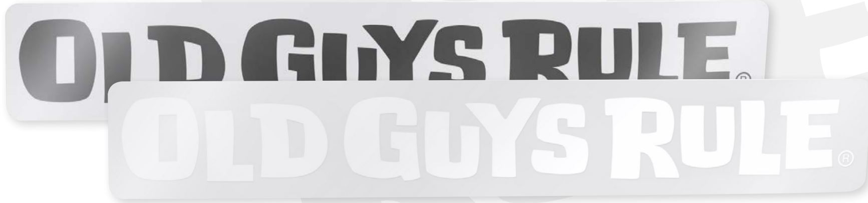
DEC004 - HORIZONTAL LOGO (WHITE) Approx 27cm x 4cm 1 Colour on Clear