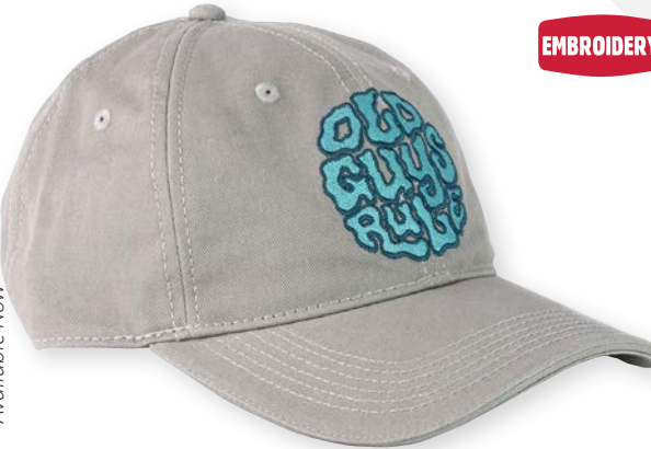
CAP009-SG - TRIP TYPE Sports Grey - OSFM Available Now