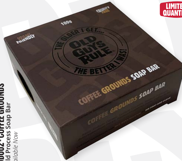
SUD002 - COFFEE GROUNDS Cold Process Soap Bar Available Now