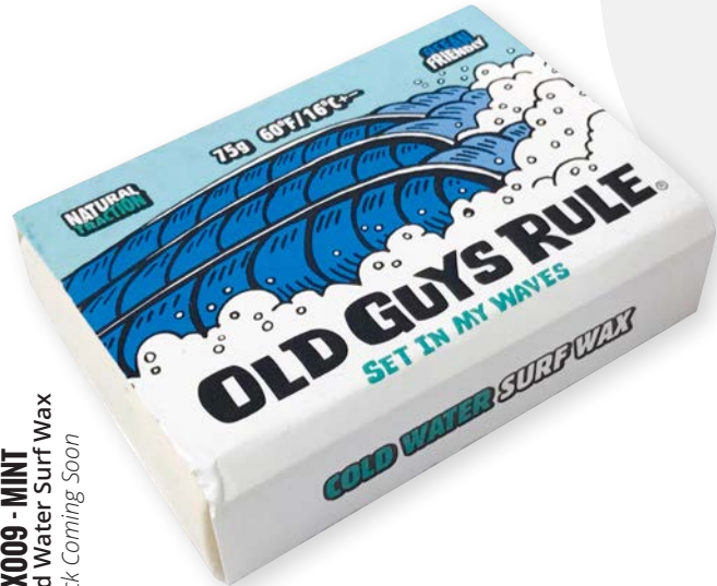
WAX009 - MINT Cold Water Surf Wax Stock Coming Soon