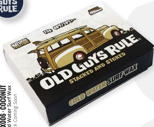
WAX006 - COCONUT Cold Water Surf Wax Stock Coming Soon