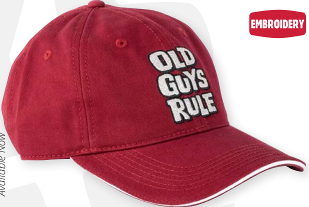
CAP008-CR - STACKED LOGO Cardinal Red - OSFM Available Now