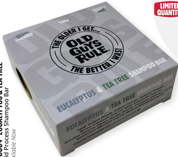
SUD004 - EUCALYPTUS & TEA TREE Cold Process Shampoo Bar Available Now