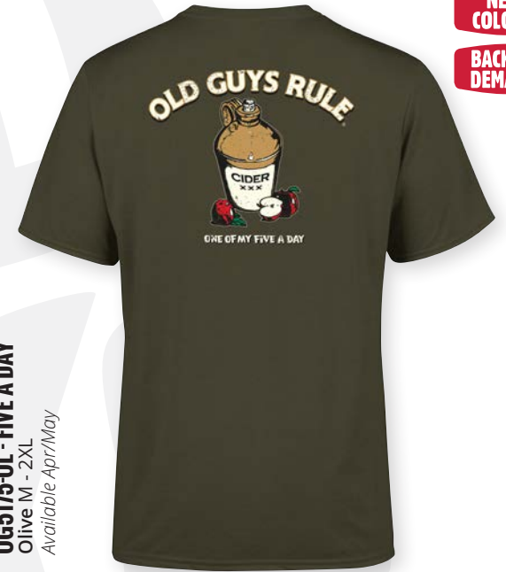
OG5175-OL - FIVE A DAY Olive M - 2XL Available Apr/May