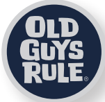
APP082-N - STACKED LOGO TWILL SHIRT Navy Check L - 2XL Available Now