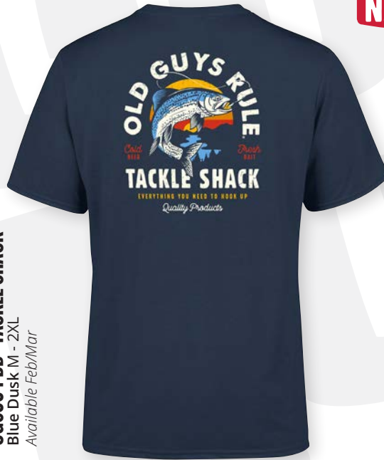
OG6004-BD - TACKLE SHACK Blue Dusk M - 2XL Available Feb/Mar