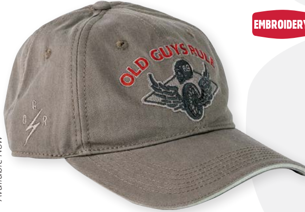
CAP007-C - VINTAGE MC II Charcoal - OSFM Available Now