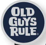
CAP004-N - LOCAL LEGEND Navy - OSFM Available Now