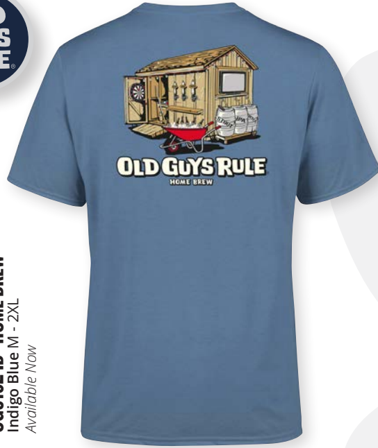
OG5192-IB - HOME BREW Indigo Blue M - 2XL Available Now