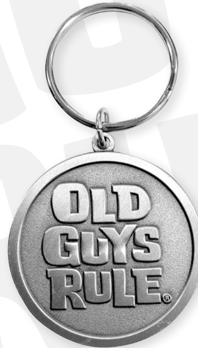
KEY002 - BRAND LOGO Antique Silver Die Struck Keyring Available Now