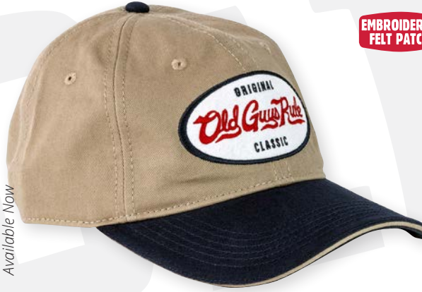
CAP005-PD - ORIGINAL CLASSIC Prairie Dust/Blue Dusk - OSFM Available Now