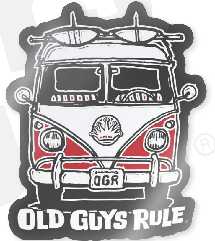
DEC012 - GOOD VIBES Approx 10cm x 12cm 2 Colour Gloss on White