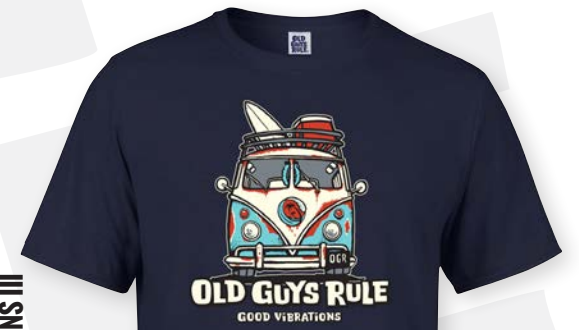
OG5195-N - GOOD VIBRATIONS III Navy M - 5XL Available Now