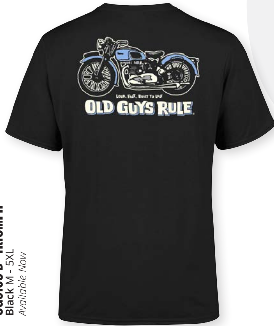
OG5168-B - TRIUMPH Black M - 5XL Available Now