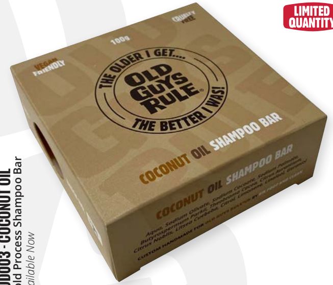
SUD003 - COCONUT OIL Cold Process Shampoo Bar Available Now