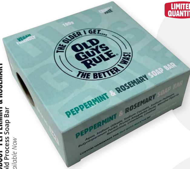
SUD001 - PEPPERMINT & ROSEMARY Cold Process Soap Bar Available Now