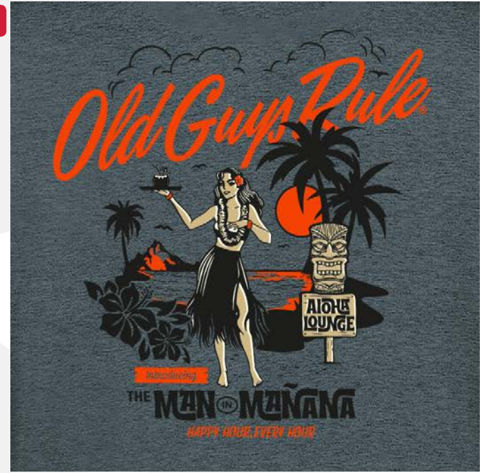
OG6003-DH - ALOHA LOUNGE (TIKI BAR) Dark Heather M - 2XL Available Now