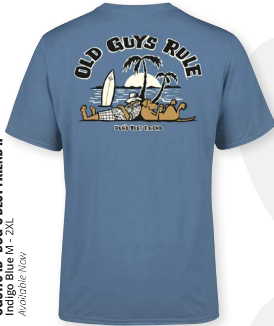
OG5179-IB - DOG'S BEST FRIEND II Indigo Blue M - 2XL Available Now