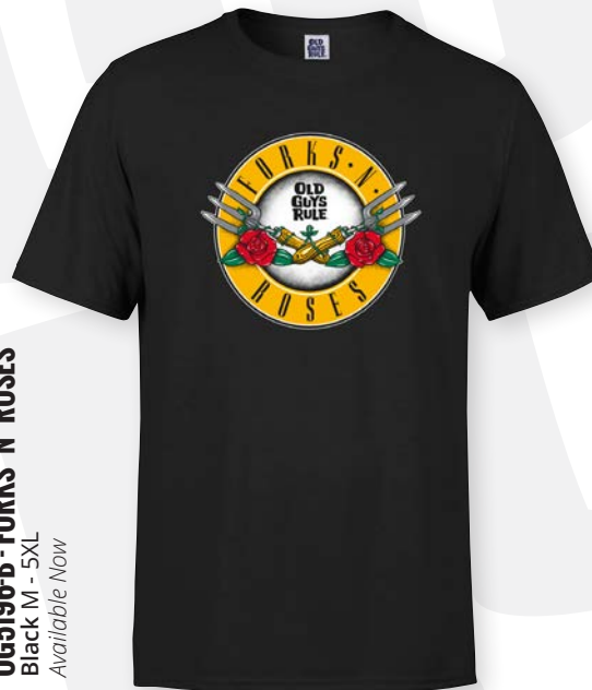
OG5196-B - FORKS 'N' ROSES Black M - 5XL Available Now