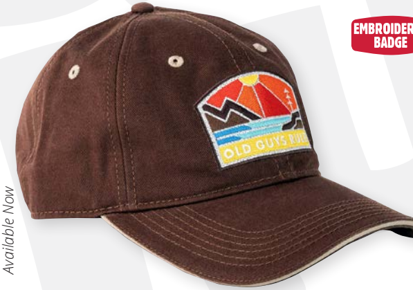
CAP010-CH - EXPLORE OUTDOORS Chocolate - OSFM Available Now