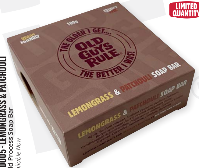
SUD005 - LEMONGRASS & PATCHOULI Cold Process Soap Bar Available Now