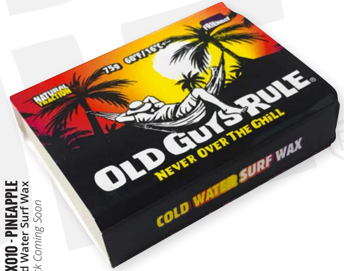
WAX010 - PINEAPPLE Cold Water Surf Wax Stock Coming Soon