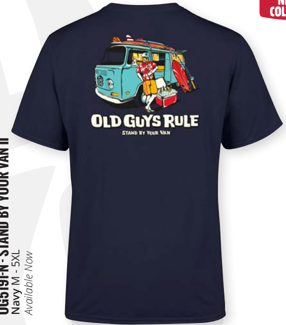
OG5191-N - STAND BY YOUR VAN II Navy M - 5XL Available Now