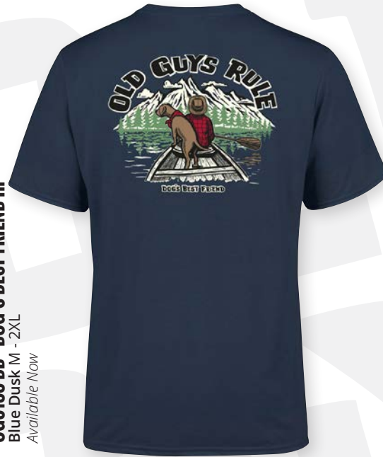
OG5188-BD - DOG'S BEST FRIEND III Blue Dusk M - 2XL Available Now