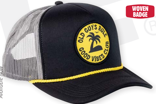
CAP011-B - GOOD VIBES CLUB Black - OSFM Available Now