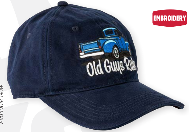
CAP006-N - DECADES Navy - OSFM Available Now