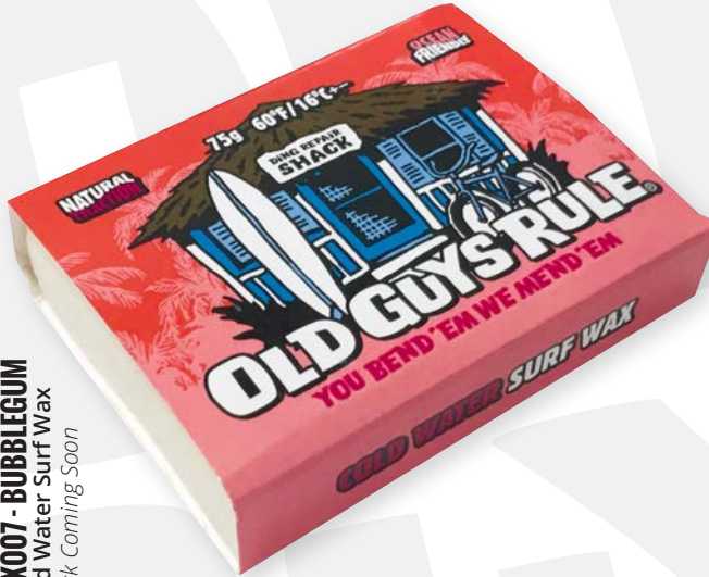
WAX007 - BUBBLEGUM Cold Water Surf Wax Stock Coming Soon