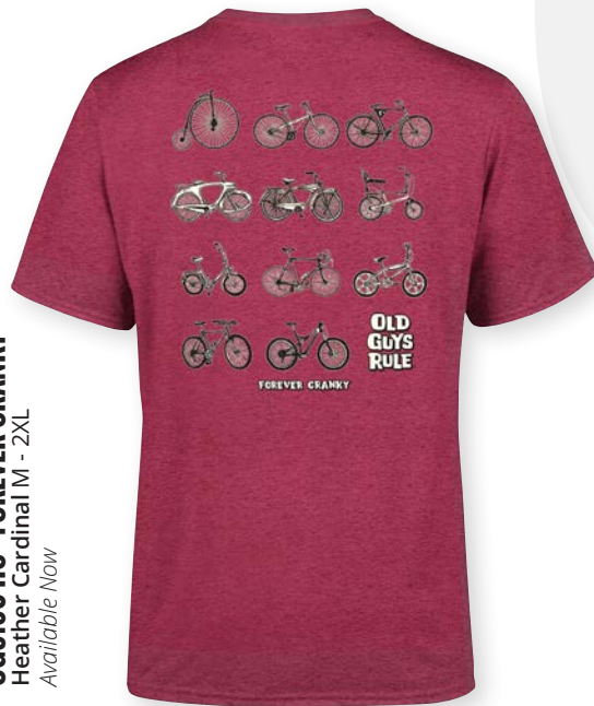
OG5190-HC - FOREVER CRANKY Heather Cardinal M - 2XL Available Now