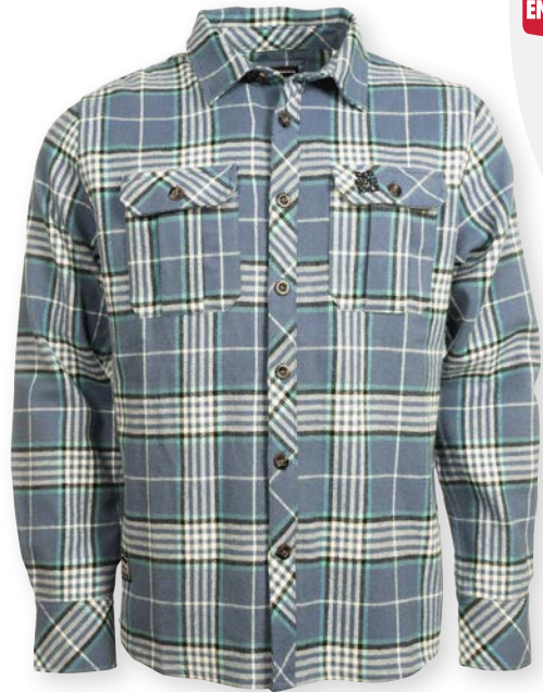
APP083-IB - STACKED LOGO TWILL SHIRT Indigo Check L - 2XL Available Now