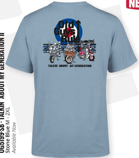
OG5199-SB - TALKIN' ABOUT MY GENERATION II Stone Blue M - 2XL Available Now