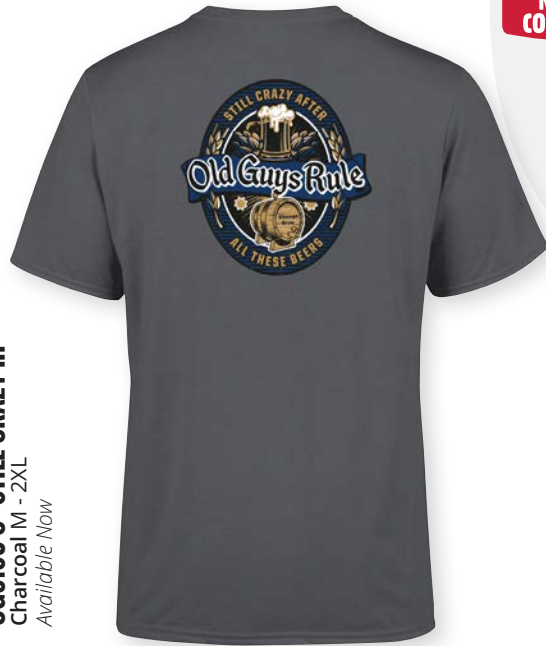
OG5193-C - STILL CRAZY III Charcoal M - 2XL Available Now