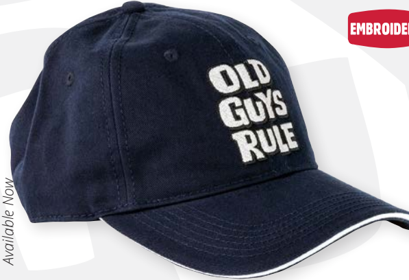
CAP008-BD - STACKED LOGO Blue Dusk - OSFM Available Now